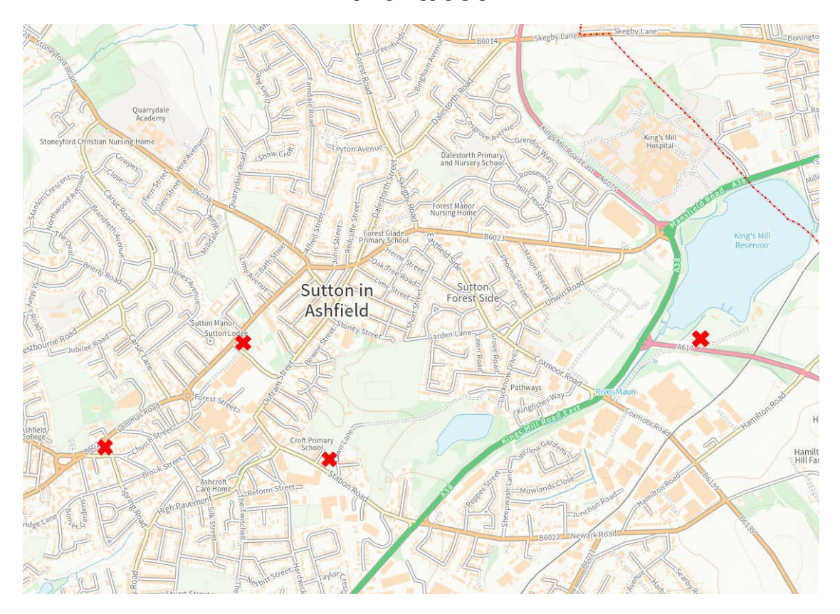
Location of advertisement boards in Sutton in Ashfield -

1. Hack Lane/Church Street 2. Priestsic Road 3. Lawn Lane 4. Mill Waters